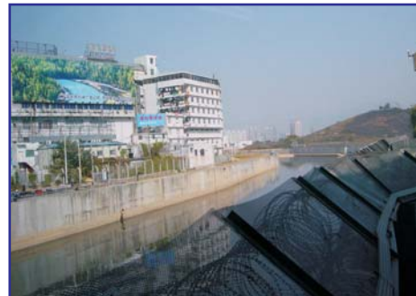
Border between Hong Kong SAR and the Shenzhen SEZ

that were created besides the administrative structure in China and therefore promise to produce a certain amount of self-organization and autonomy (Special Administrative Regions, SAR; Special Economic Zones, SEZ)