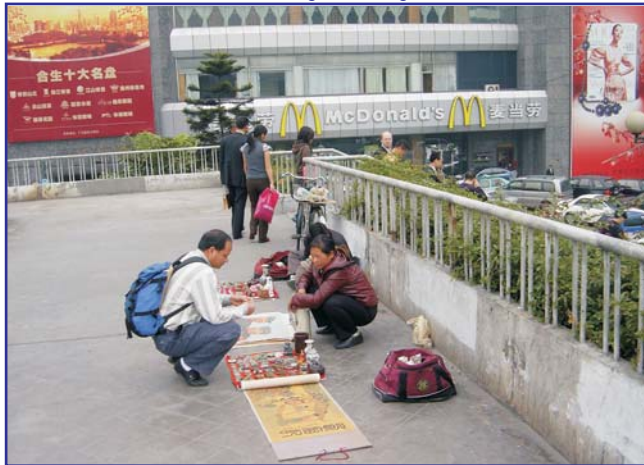
Informal Trader on a Pedestrian Bridge in Guangzhou 2006

Borders are lines of separation around spaces & groups. We look at formal and informal borders (at different levels from national to local) and view all of them as socially constructed and as expressions of ever-changing political, socio-economic and cultural circumstances. Borders have functions in territorial governance and planning, and they have meanings for the people living with them. Our approach is to look at both aspects: top-down and bottom-up.