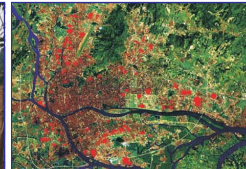
Urban villages (red) in the heart of Guangzhou

of different social status and physical structure at the neighbourhood level (urban villages, housing estates, gated communities)