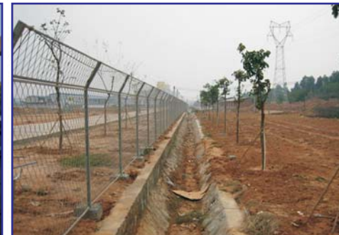
Factory compound surrounded by a fence in Guangzhou

Bounded spaces that serve mainly as places of work and for economic development (Export Processing Zones, EPZ; factory compounds etc.)