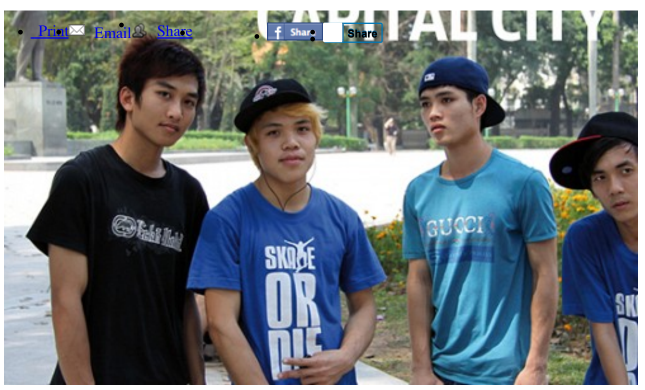
PrevNext The Goethe Institute Vietnam is calling for photo contributions to a non-profit photo book about the country's capital city.

According to the organizers, the book "TP. Hà Nội CAPITAL City" is printed in joint cooperation with the institute and with support from numerous Vietnamese companies and institutions.