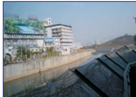
Border between Hong Kong SAR and the Shenzhen SEZ

that were created besides the administrative structure in China and therefore promise to produce a certain amount of self-organization and autonomy (Special Administrative Regions, SAR; Special Economic Zones, SEZ)