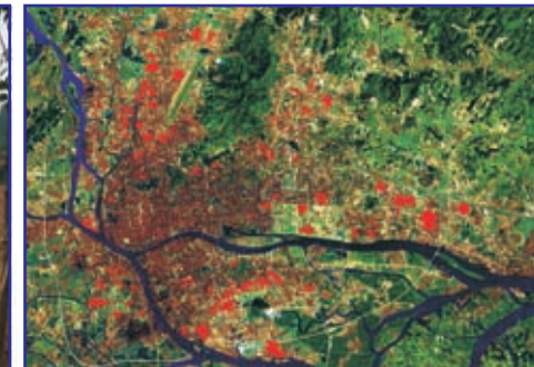
Urban villages (red) in the heart of Guangzhou

of different social status and physical structure at the neighbourhood level (urban villages, housing estates, gated communities)