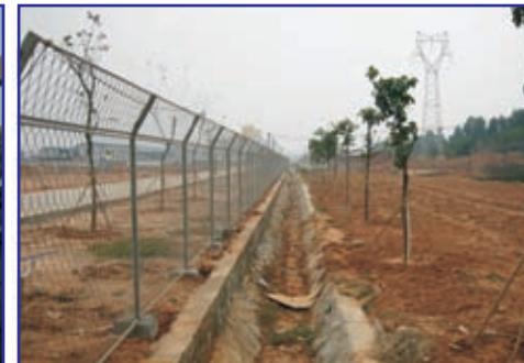
Factory compound surrounded by a fence in Guangzhou

Bounded spaces that serve mainly as places of work and for economic development (Export Processing Zones, EPZ; factory compounds etc.)