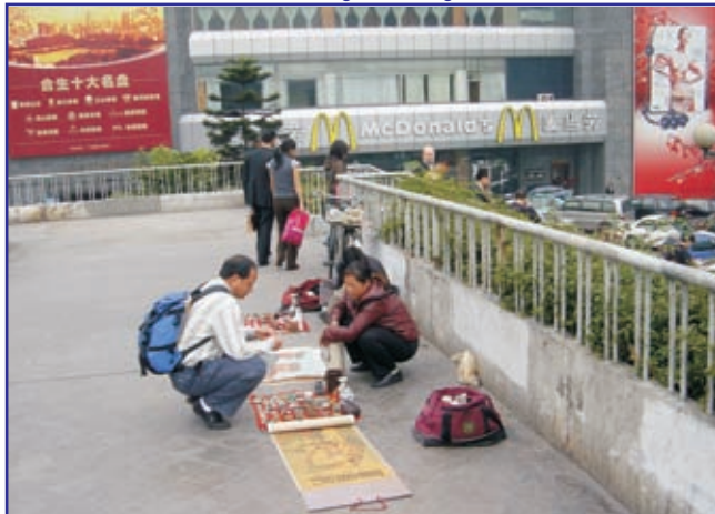
Informal Trader on a Pedestrian Bridge in Guangzhou 2006

Borders are lines of separation around spaces & groups. We look at formal and informal borders (at different levels from national to local) and view all of them as socially constructed and as expressions of ever-changing political, socio-economic and cultural circumstances. Borders have functions in territorial governance and planning, and they have meanings for the people living with them. Our approach is to look at both aspects: top-down and bottom-up.