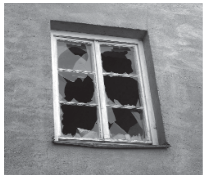
Civil-military interaction is an essential element of post-conflict rehabilitation and reconstruction.

http://www.sef-bonn.org/download/publikationen/policy_paper/pp_30_en.pdf