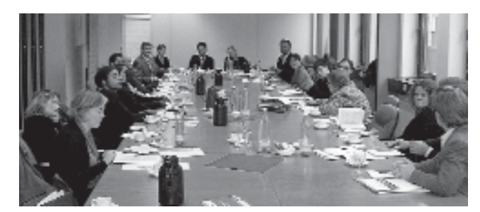
Migrant organisations as independent actors within the field of development cooperation: the SEF's Metropolis Workshop.