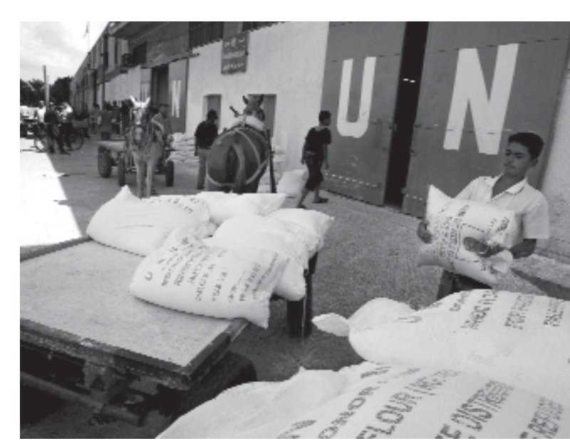
Stronger leadership by the EU in the UN is necessary in order to achieve the MDGs.