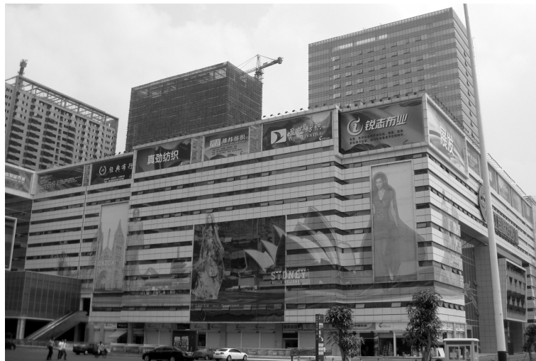
Figure 3: The Pearl River International Textile City main building