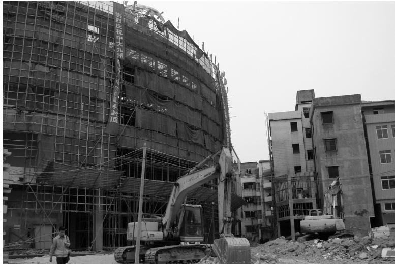
Figure 2: Erection of a new wholesale mall next to urbanized village structures