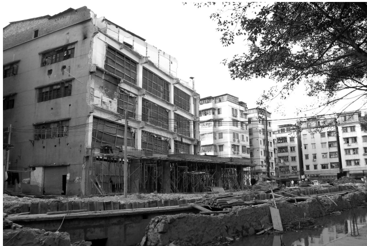
Figure 1: Demolition of a textile factory building in Zhongda textile district