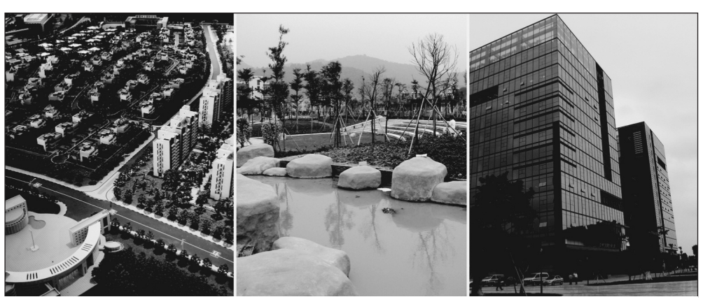
Fig. 3: Residential-, leisure- and work-spaces in Gouangzhou Science City

All in all, it can be said, that the deliberate use of informal arrangements in the development of GSC served local officials to learn from exogenous experiences via interactions with foreign, returning overseas Chinese, and domestic investors. In this regard, investment, especially foreign direct investment can not only be regarded as a driver for economic growth but also an important channel of knowledge diffusion for changing urban governance processes (CHIEN/ZHAO 2008). There is a close connection between urban development strategies and locational policies of GSC since the compre-