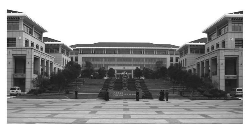
FIGURE 5: Joint headquarter of Luogang District and of GDD Administrative Committee