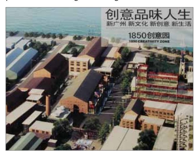
Sketch of Guangzhou 1850 Creativity Zone

Formality and informality in newly industrialized countries give a complex picture. Ananya Roy argues that informality is "a mode of metropolitan urbanization". The Chinese party-state tolerates, promotes and utilizes informality when it serves the development and when it produces new strategic knowledge.