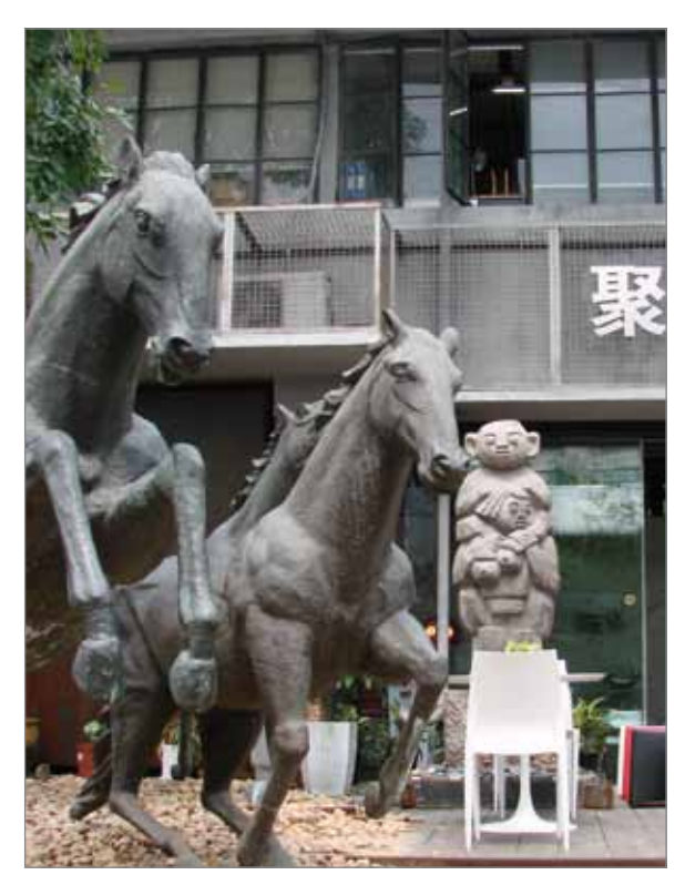
OCT Contemporary Art Terminal in Shenzhen