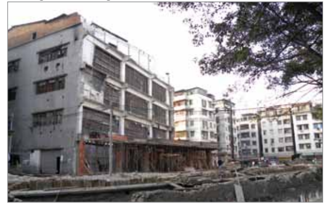
In case of this area, we investigate the governance of the ongoing restructuring process of a comparatively established industry. Due to increasing global and local competition, local stakeholders have initiated a massive shift from traditional knitting and assembling towards the erection of huge wholesale malls combined with housing. Of special interest here is the economic dimension of this process.