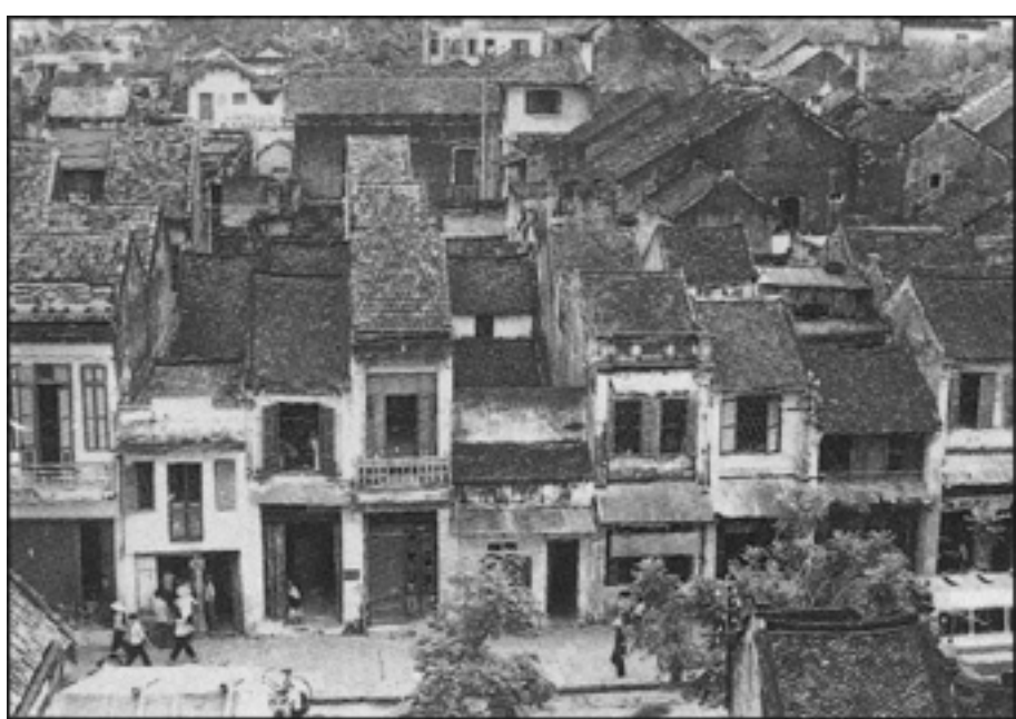
Fig. 2: The Ancient Quarter during the phase of state economic planning and administration