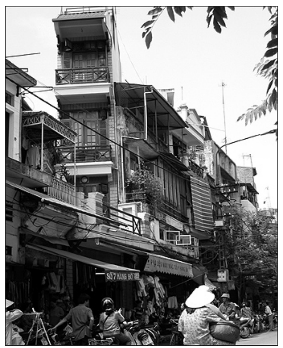
Fig. 4: Newly erected buildings in the Ancient Quarter of Hanoi, Hang Bo Street