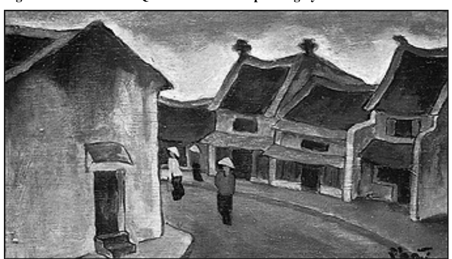
Fig. 3: The Ancient Quarter as seen in a painting by Bui Xuan Phai

Source: Bui Xuan Phai 1973, 20.5 x 35.5 cm.